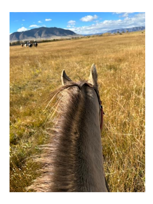
And ... the best seat in the house!